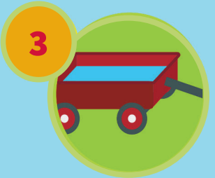
3 Any toy, garden equipment, or container that can hold water.