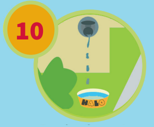
10 Leaky faucet and pet bowl.