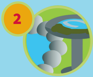
2 Birdbath and garden pond.