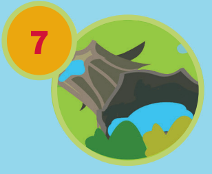
7 Tree hole, hollow stump, or rain puddle.