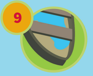
9 Uncovered boat or boat cover that collects water.