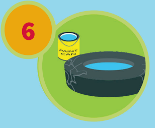
6 Trash and old tires.