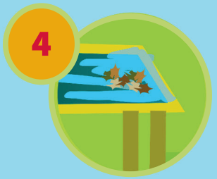
4 Flat roof with standing water.