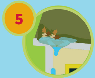
5 Clogged rain gutter.