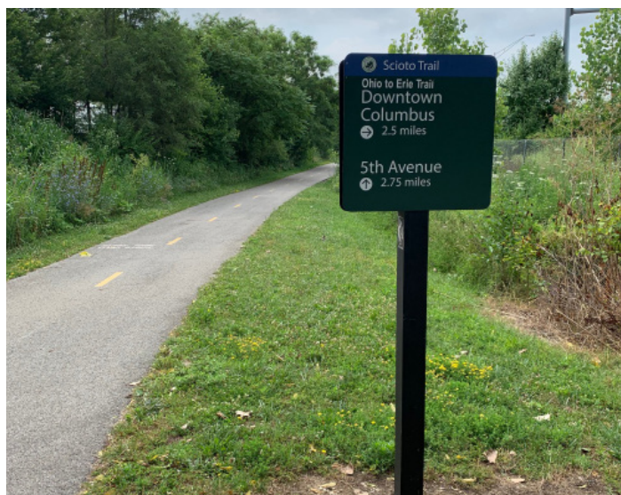
Wayfinding signage helps bicyclists navigate the bikeway network.