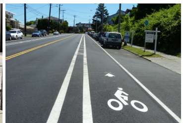
Buffered Bicycle Lane