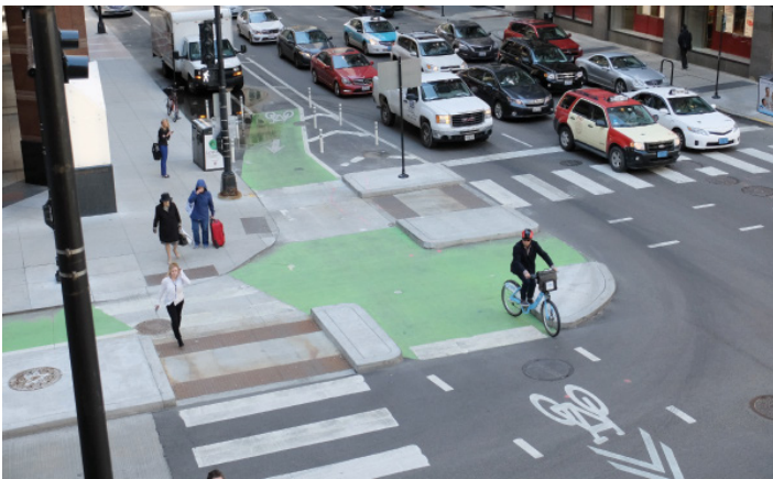
A protected intersection reduces conflicts between motor vehicles and bicyclists.