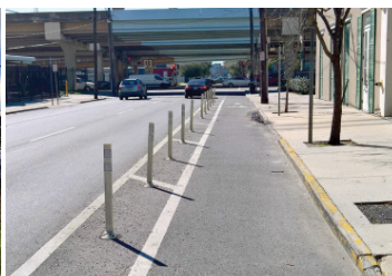
Separated Bicycle Lane